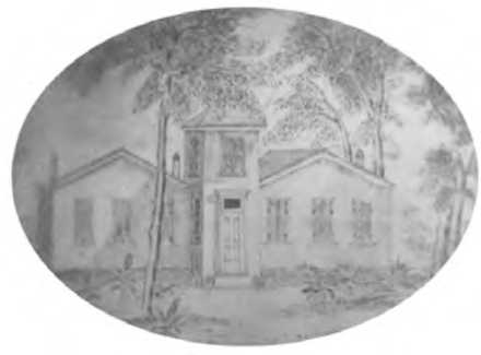
Old Beaver School

The history of public education in Beavercreek begins initially with the Northwest Ordinance passed by the Congress of the United States in 1787. This act formally established the Northwest Territory (now the states of Ohio, Indiana, Illinois, Wisconsin and Michigan), and among other things, outlined procedures for statehood and prohibited slavery within its boundaries. Most importantly for public education, the Ordinance declared that "schools and the means of education shall forever be encouraged."