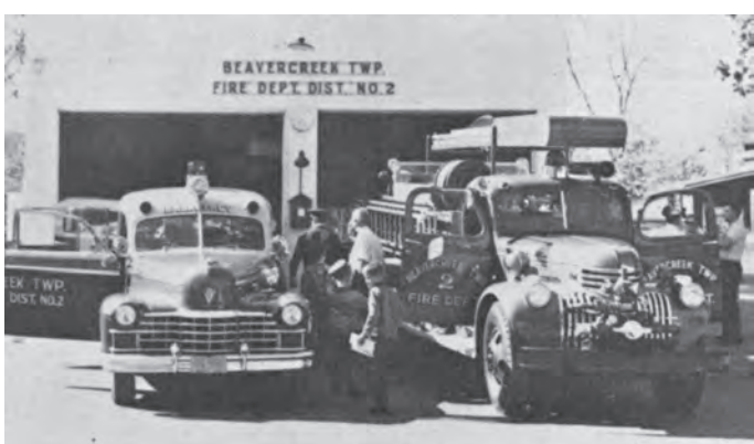
One of the first two trucks of the Beavercreek Fire Department.