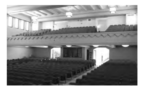
Recent renovation of the auditorium at Main Elementary