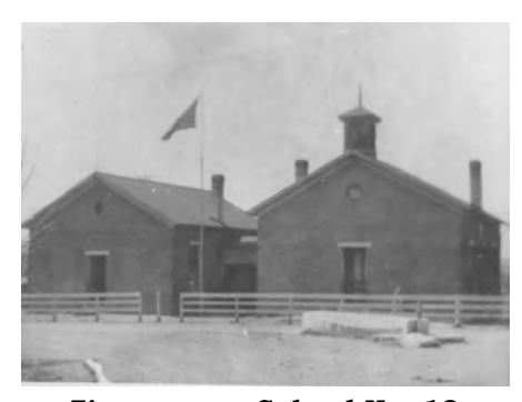
Zimmerman School No. 12 Southwest corner of Dayton-Xenia and Farfield Road

Greene County, attracting pupils from all parts of the county..... that students who completed the courses at "Old Beaver" were able to enter the Sophomore Class at Miami University." The Old Beaver (Union) School stood at the site of a granite marker behind the present Beaver Church on Dayton-Xenia Road.