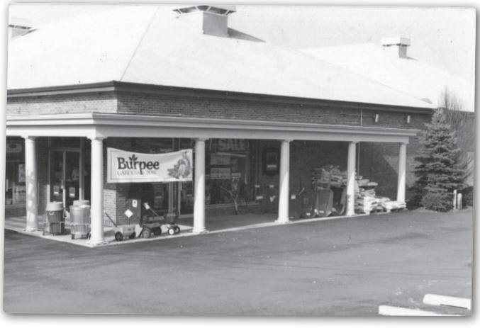
The Dayton-Xenia store in April 1983

Things were going swimmingly until the 1980s when Lowe's, Home Depot and other chain stores arrived and market conditions became troublesome. Among other things it became more common for stores to have extended hours and be open on Sundays, but the only time Dunnigan's had Sunday hours was when they had end-of-the-summer tent sales. At these times they sold seasonal merchandise and goods they'd put aside or purchased just for the sale.