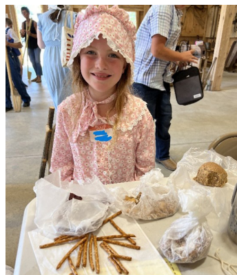
Old fashioned lunch