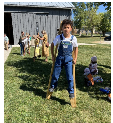
Playing outdoor games