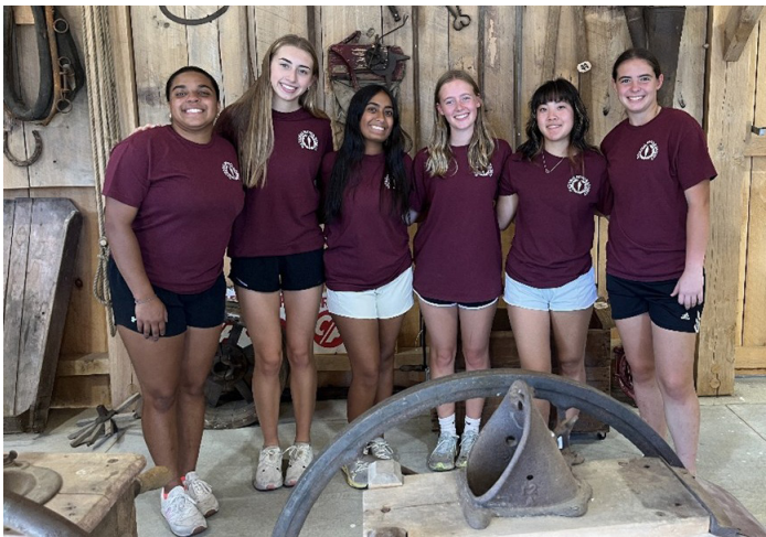
Beaver-creek High School student volunteers who earned service hours by helping with set-up and tear-down.